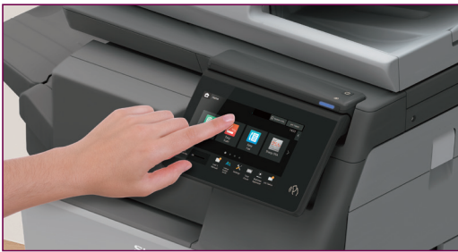
Sharp's award-winning user interface - designed to make life easier.

Our devices feature an LCD touchscreen control panel with Sharp's award-winning Easy UI*, which provides an intuitive display and easy access to commonly used functions. Or you can customise it to suit your own way of working simply by dragging and dropping the menu icons.